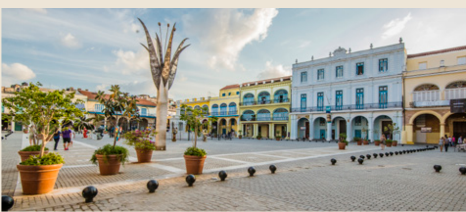
A three days special program to discover Havana together with a specialized architect, divided in the most important areas: Old Havana – Center Havana, Vedado and Miramar. A city strongly marked by its Spanish backgrounds, as well as the neo-classic, styles of New Art, Art Deco and Eclectic currents.