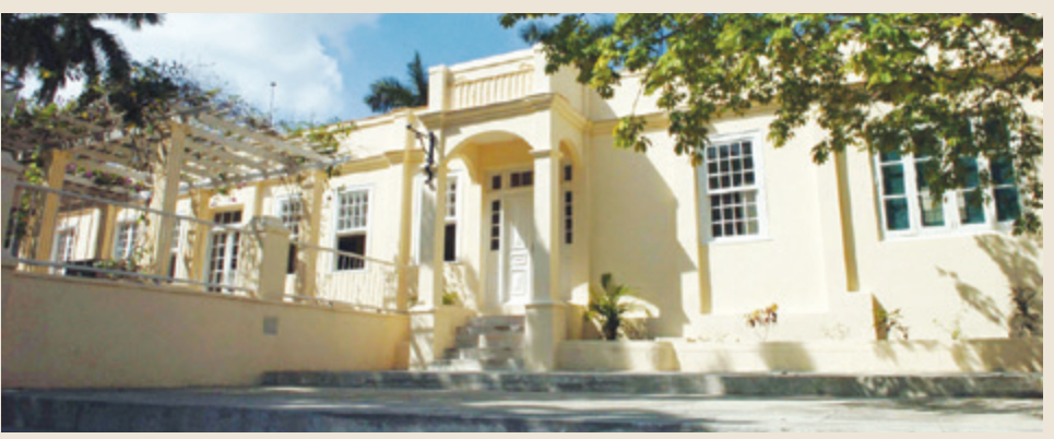
Tour to La Vigía farm, home of famous American writer Ernest Hemingway.