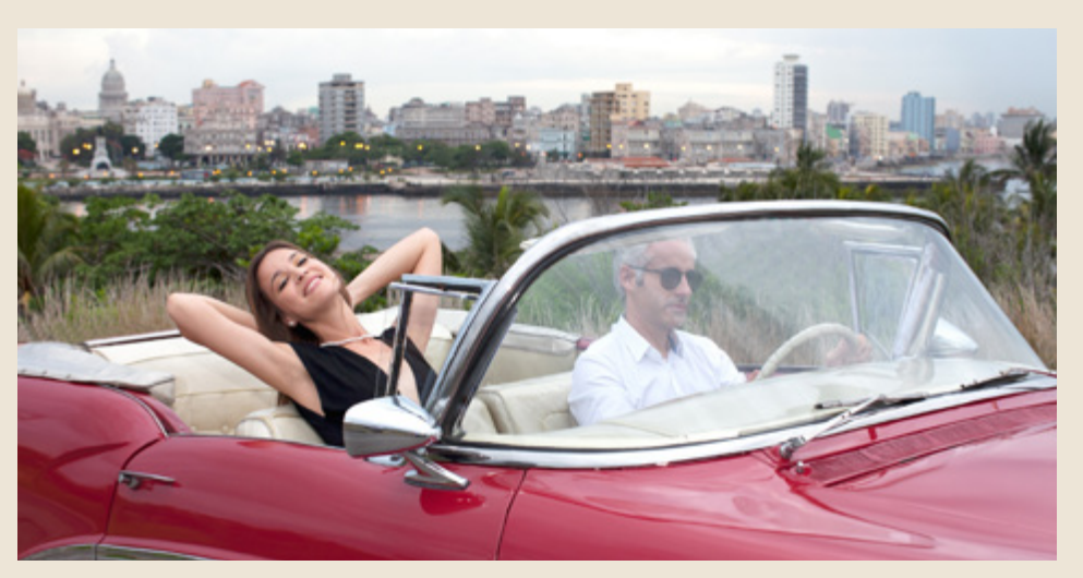
Panoramic tour in classic cars in Havana at sunset.