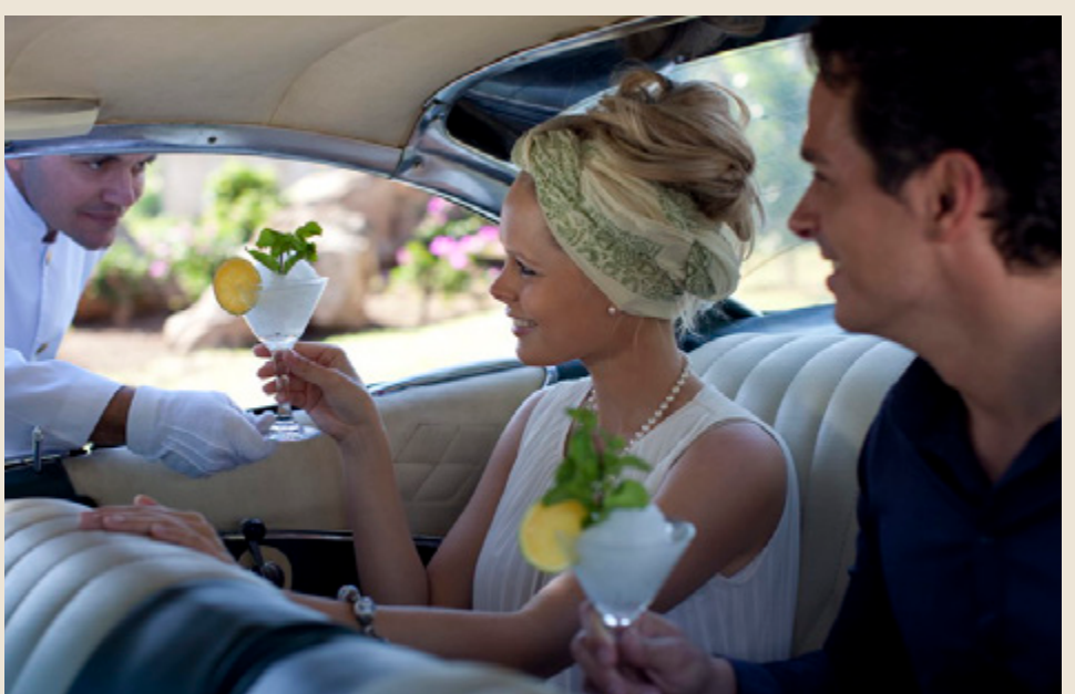
Our services are oriented to the full satisfaction of the most demanding travelers in an environment of guarantee, security and exclusiveness.

The specialized brand of Cuba Solways Agency, DMC from Cuban Meliá International Hotels, for the exclusive design of trips and luxury experiences in the Greater Antilles.