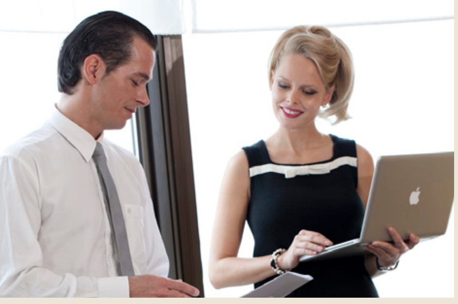
We distinguish an expertized and professional team in the destiny, which is full engaged in the organization of special programs to enjoy the most authentic attributes that characterize the Cuban nation, forging a unique and unforgettable experience.