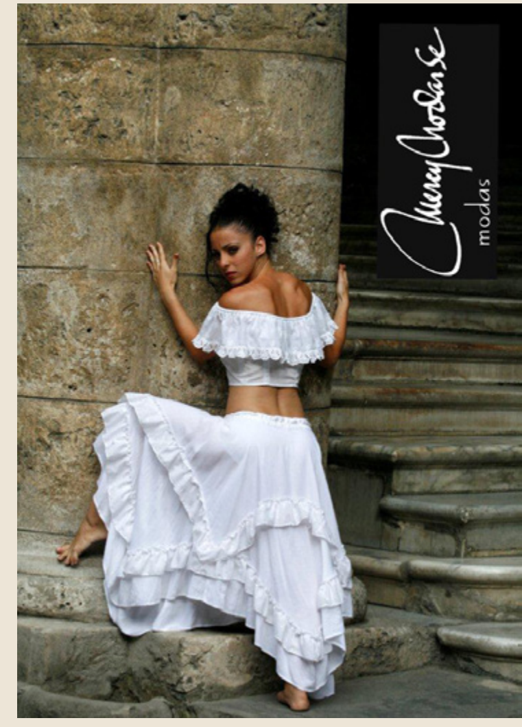
Visit modern and traditional Cuban cloth designers, to learn about their technics and exclusive features. Interact with these personalities and hear stories about special clients.