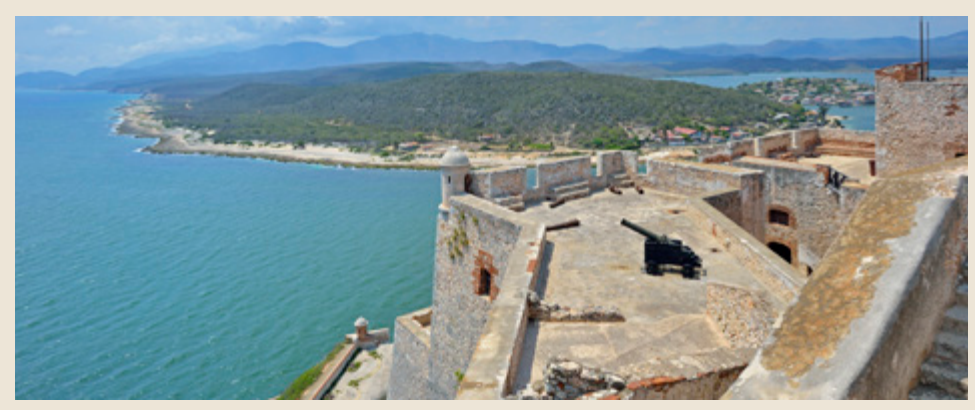
Historic tour to Santiago de Cuba: Former capital of the country from 1515 until the XVI Century. Special tour through the city; a visit to the Moncada fortress, the Santa Efigenia Cemetery, where rests Commander Fidel Castro, the Diego Velazquez Museum and the Morro Castle.