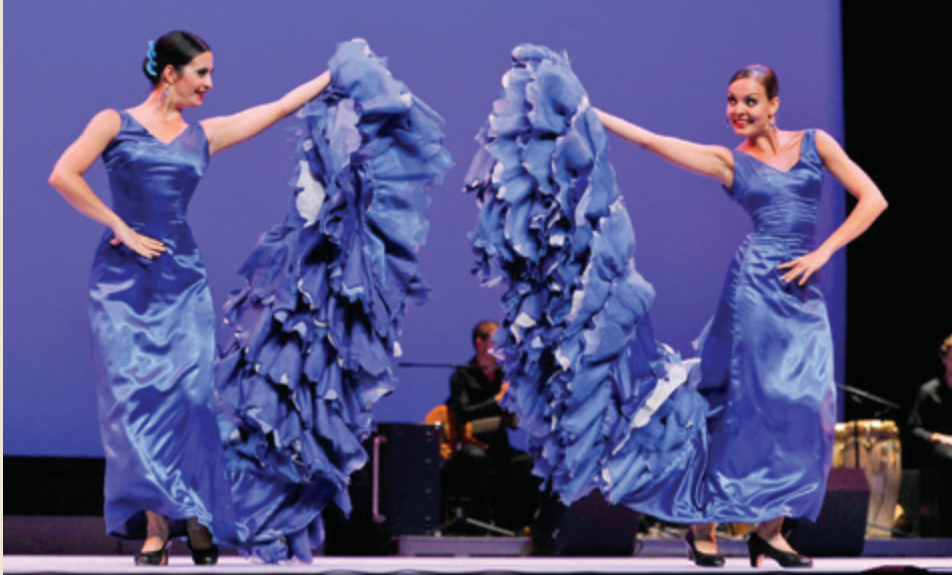
Visit the Litz Alfonso Dance Company is an example of authentic Cuban art. It's one of the most beautiful and interesting experiences, and above all of the highest cultural level.