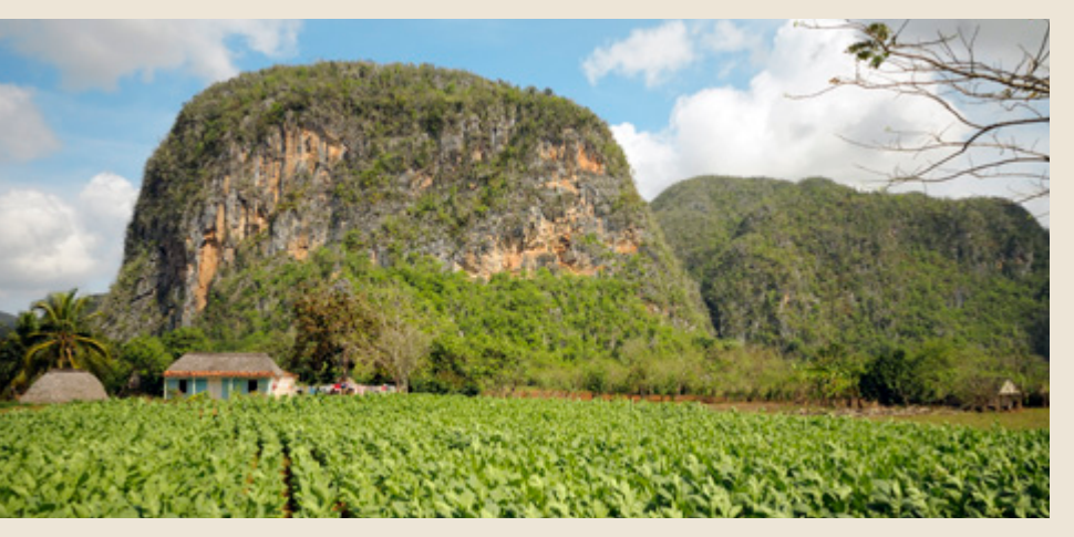
Special Tour to Viñales Valley and visit tobacco fabrics in Pinar del Rio, specially the Robaina Farm, known in the world for its productions and for the exquisite treatment of the tobacco leave; continue to the Viñales Valley, a beautiful natural region, declared by the UNESCO as Cultural Landscape of Humanity.