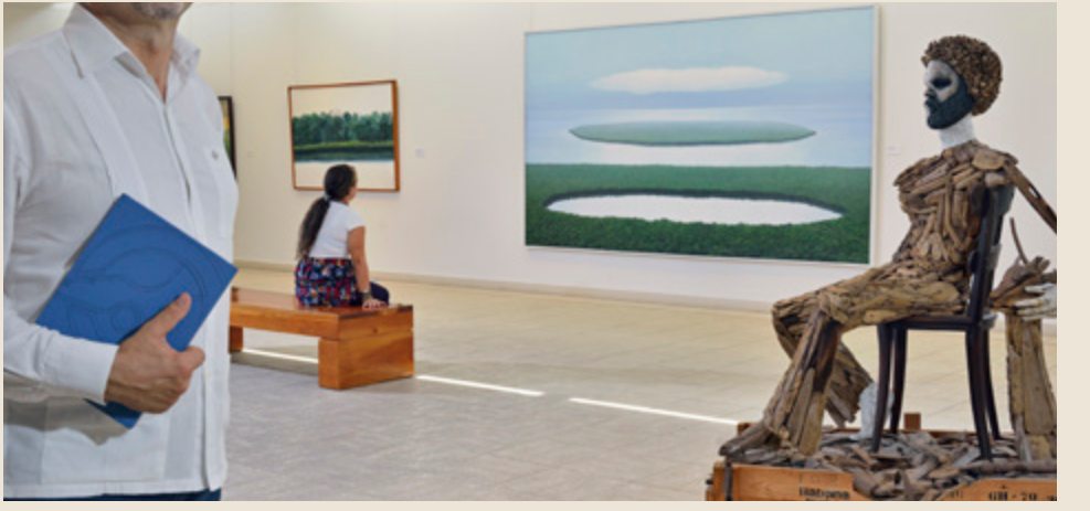
Fine Arts Museum: It's the most important space in Cuba that treasures, restores, preserves and promotes the works that are part of Cuba's plastic heritage. It counts with two halls: Universal Art and Cuban Contemporary Art.