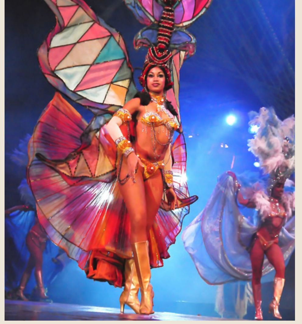
Night tour to the main sites for moda, as well as the emblematic Cabarets of Tropicana and Parisien. Enjoy the Buenavista Social Club performance